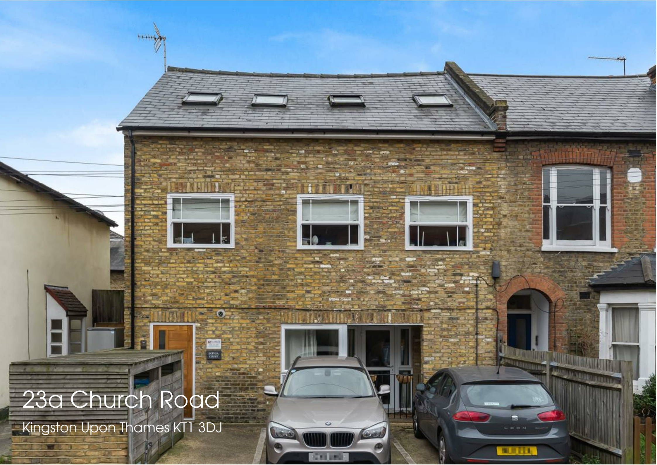
23a Church Road Kingston Upon Thames KT1 3DJ